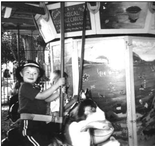
Above, the Carousel ride at Lenny & Joe's in Madison was great success. At right these young supporters take a break from the fun to pose for a photo.